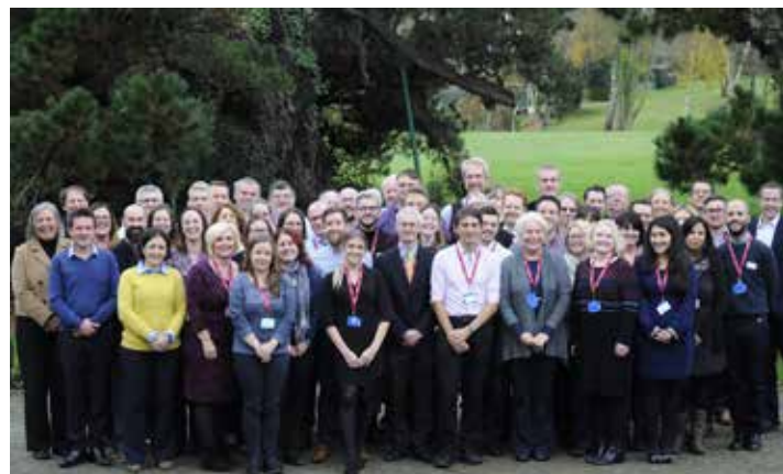
MY CARE Clinical Pathway Improvement