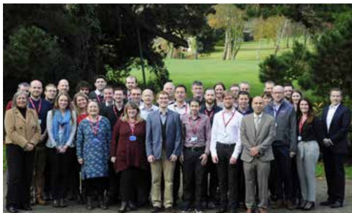
MY CARE Digital Transformation

I would like everyone to know how committed the MY CARE team of nearly 650 people are to a shared purpose of improving the experience of people (our public, patients, carers and staff). The outcomes and results of MY CARE will benefit everyone, supporting individuals to live healthier lives.